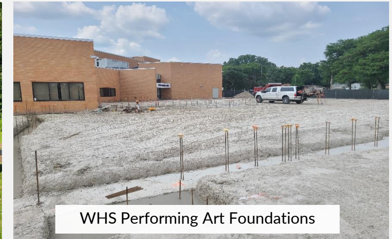
WHS Performing Art Foundations