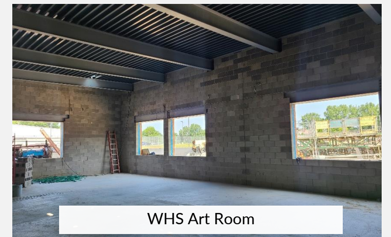
WHS Art Room