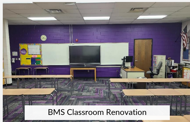
BMS Classroom Renovation